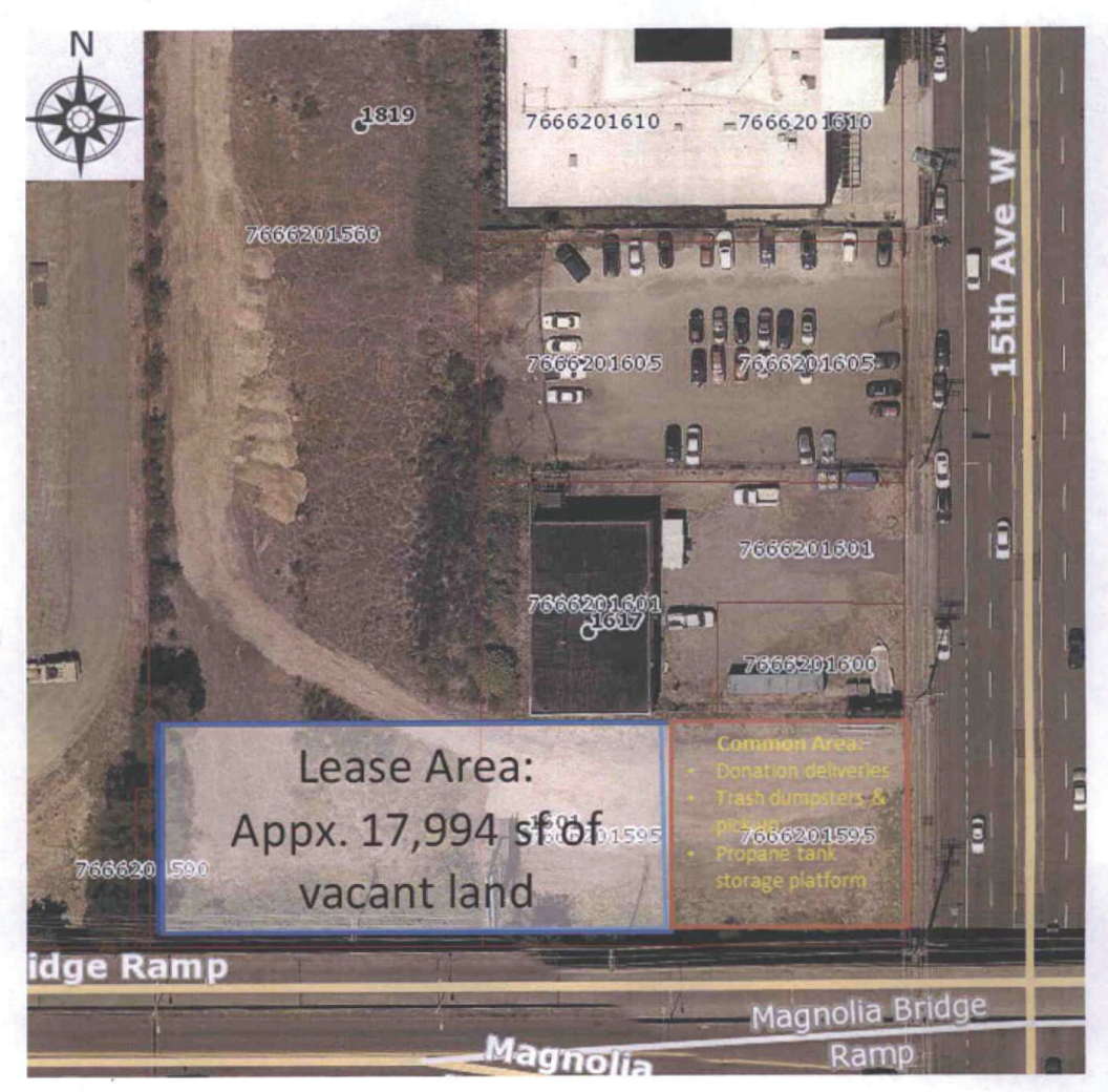
Exhibit B-3 Approximately 17,994 Square Feet of Lease Area at Tsubota Site